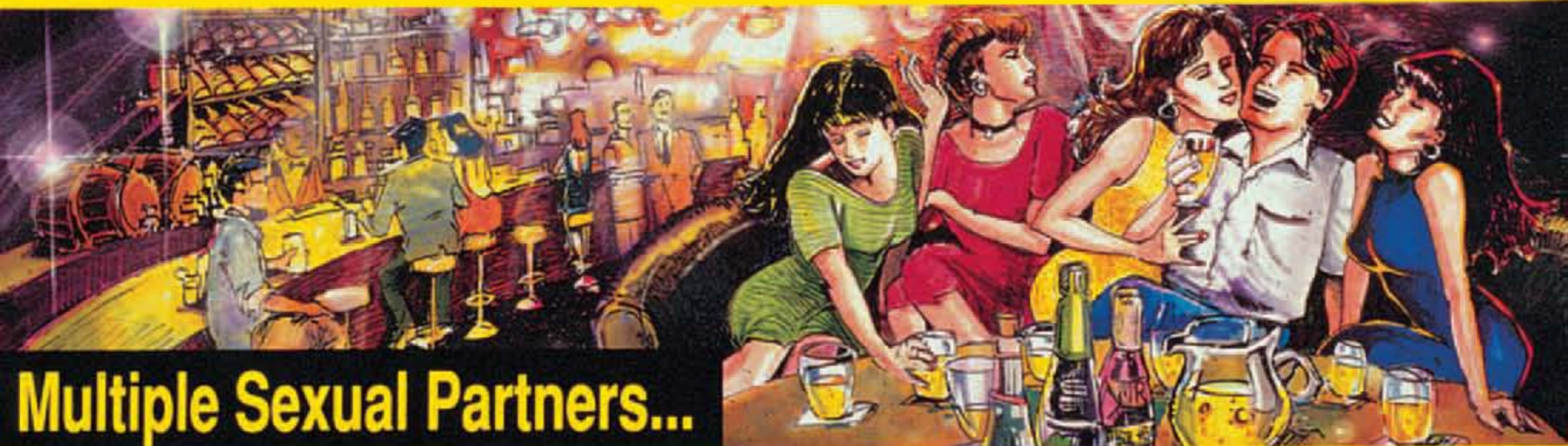
Multiple Sexual Partners...