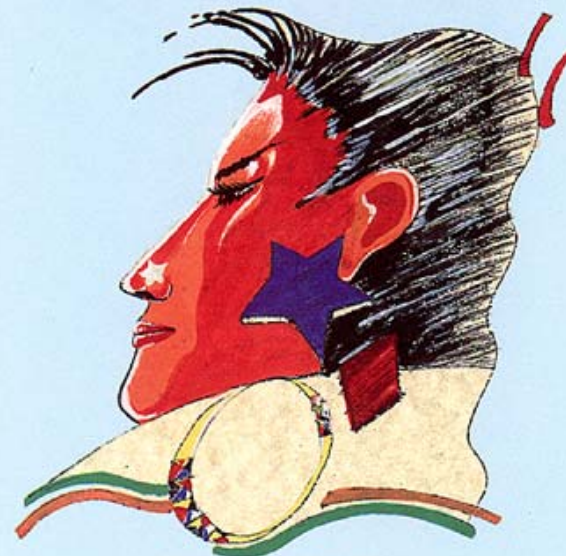
GUIDE LINES FOR EAR PIERCERS