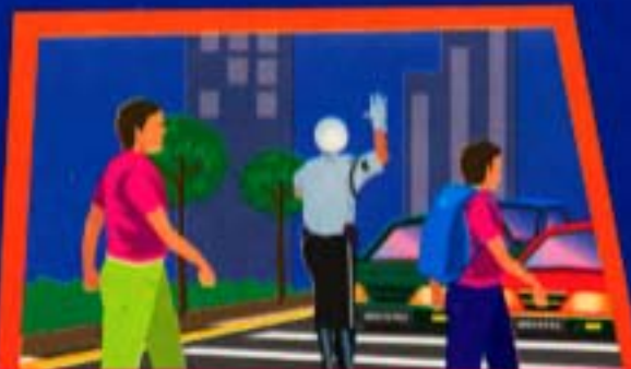
Where there is a policeman / traffic warden