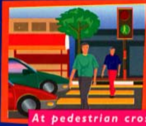
At pedestrian crossings