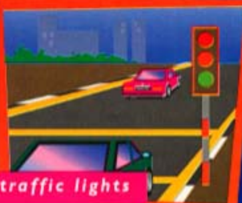
At the traffic lights