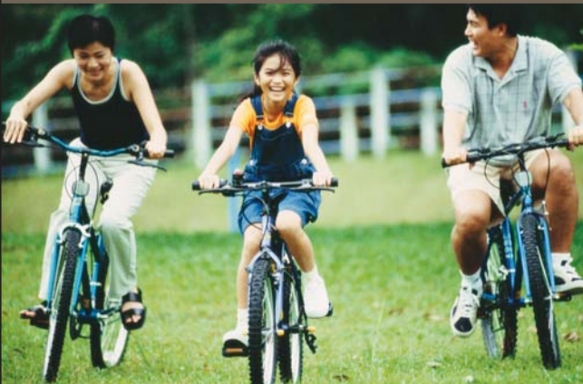
Be Physically Active

ACT NOW BEFORE IT'S TOO LATE! Practise A Healthy Lifestyle