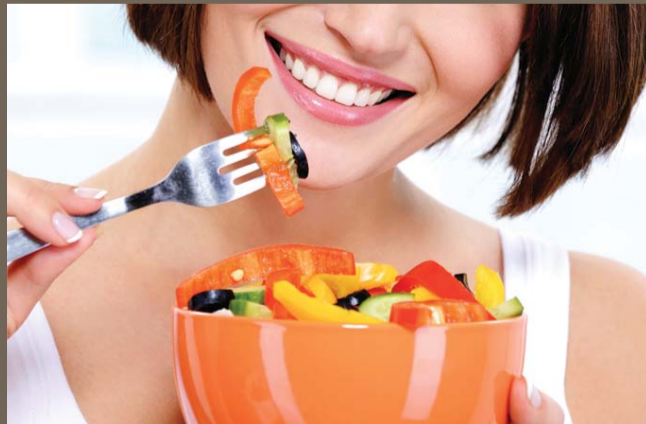
Practise Healthy Eating