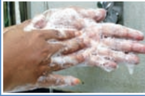
2. Rub your palms