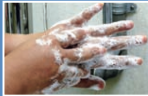
5. Rub back of hands and between fingers