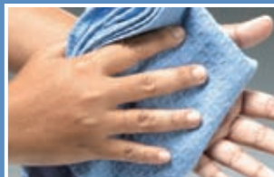
7. Dry hands with clean cloth or tissue