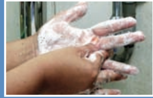
3. Rub each finger and between fingers