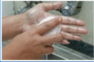
1. Lather hand with soap