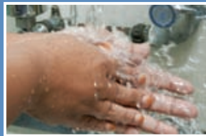
6. Wash hands with sufficient clean water