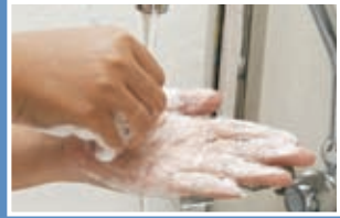
4. Scrub nails on palms