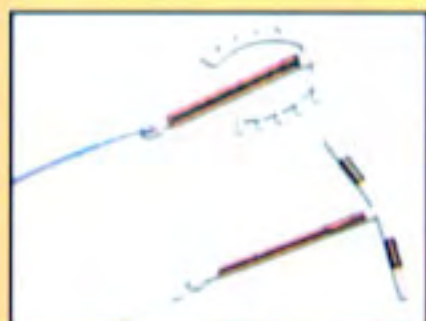
Intra-Uterine Contraceptive Device (IUD)