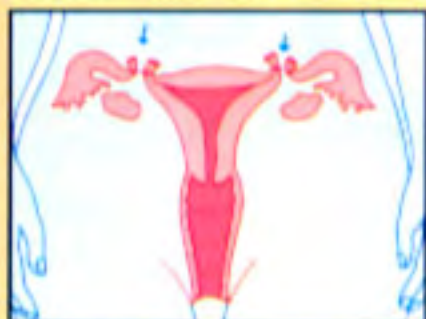
Bilateral Tubal Ligation